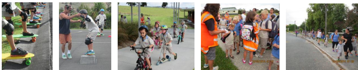
How far did we walk?