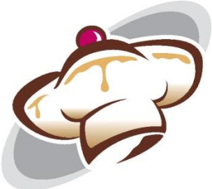
The Dough Puncher