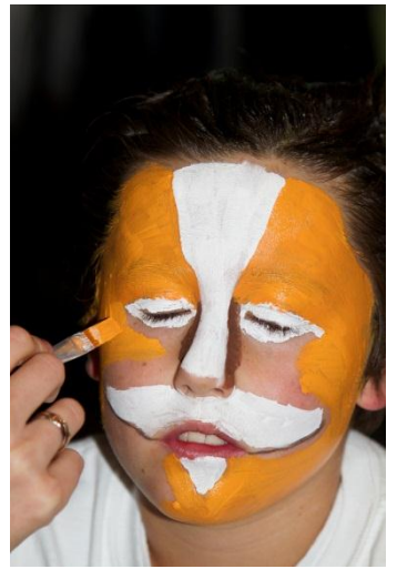
Thanks Lyndsay Pahl for our great photos!