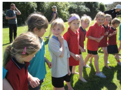
INTERSCHOOL CROSS COUNTRY

The meeting place for your child after school is in the central courtyard. Any children not collected from here will be taken to the office. We would appreciate you move from the courtyard promptly after school to allow for skids activities and organisation of bus children. Thank you.