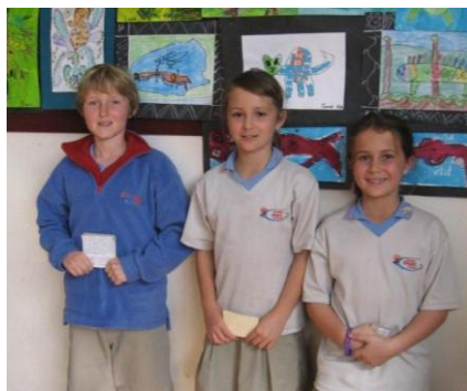
SBS SPEECH WINNERS