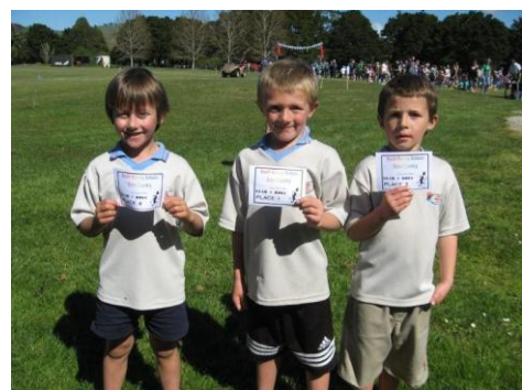
INTERSCHOOL CROSS COUNTRY WINNERS